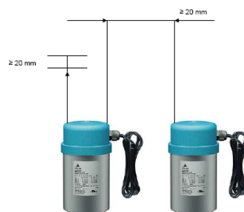
Figure 1: Minimum space over and between the capacitors.